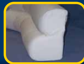
Example of lumbar support