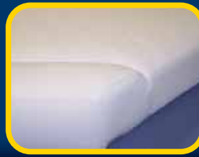
Example of rolled front