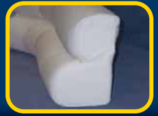
Example of lumbar support